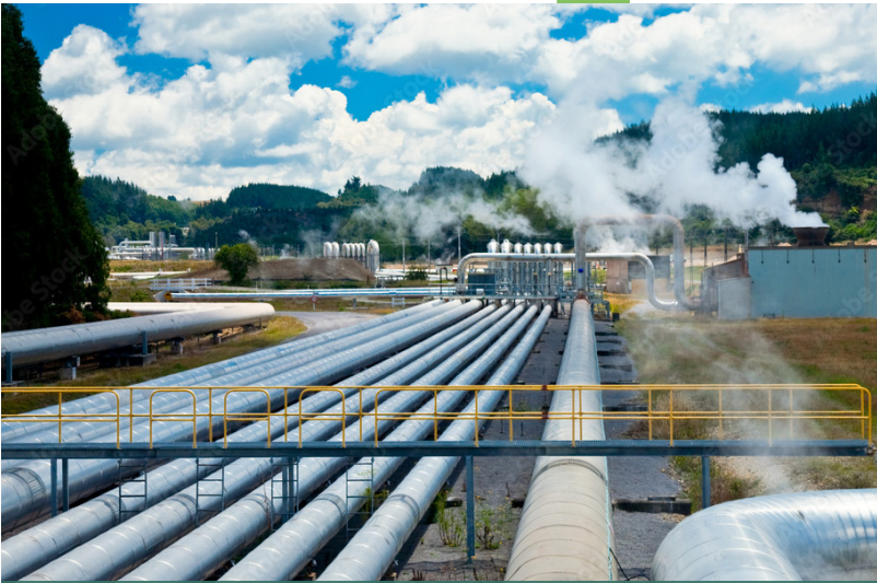
With the vast geothermal potential in the region, East Africa can become a leading player in clean and sustainable energy production.