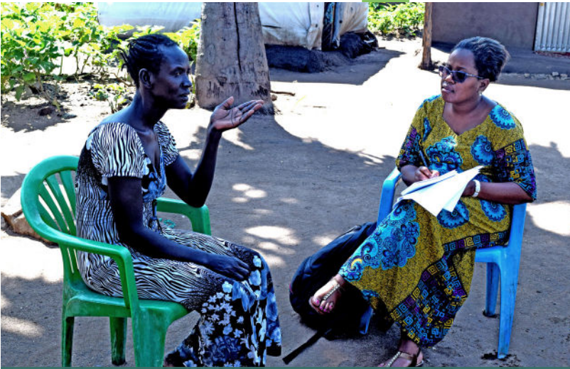
Many FDPs face significant challenges, particularly in accessing financial services.

The bank had facilitated 66,000 remittance transactions amounting to GBP 1.7m.