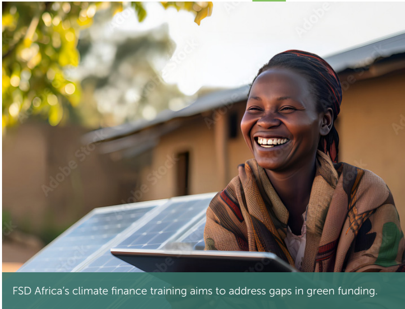
FSD Africa's climate finance training aims to address gaps in green funding.

Globally, climate change poses a severe threat, particularly affecting vulnerable regions like sub-Saharan Africa. Climate shocks in this area worsen social tensions and food-security concerns uniquely. The region has long neglected climate change issues, requiring urgent and reliable financial resources to address extreme weather events. Concerns also persist about the lack of strong mechanisms to prevent the diversion of existing climate financing.