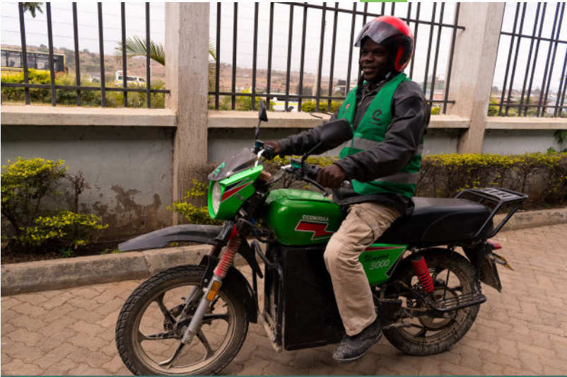
Persistent Energy Capital fund invests in e-mobility, solar home systems, commercial and industrial solar, energy efficiency and ecosystem enablers.

In 2023, with FSD Africa Investments (FSDAi) support, Persistent Energy Capital kicked off fundraising for its US$100 million Africa Climate Venture Builder Fund. The fund will accelerate and amplify access to equity and venture-building support for visionary and green innovators across Sub-Saharan Africa.