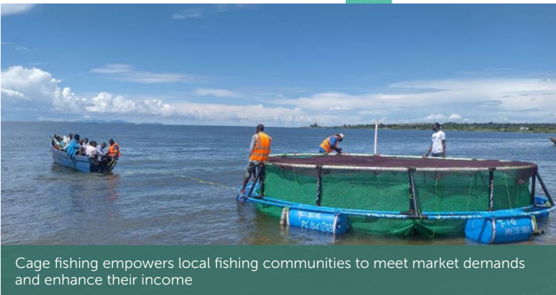
Cage fishing empowers local fishing communities to meet market demands and enhance their income

The community pays monthly for the cage and fish feed, with the remainder expected after the final harvest in the seventh month.