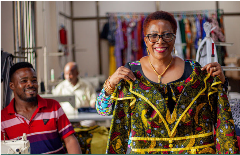
The Jasiri Gender Bond plays a crucial role in stimulating economic growth and empowering women in business.

This differs significantly from the corporate bond market’s reliance on institutional investors.