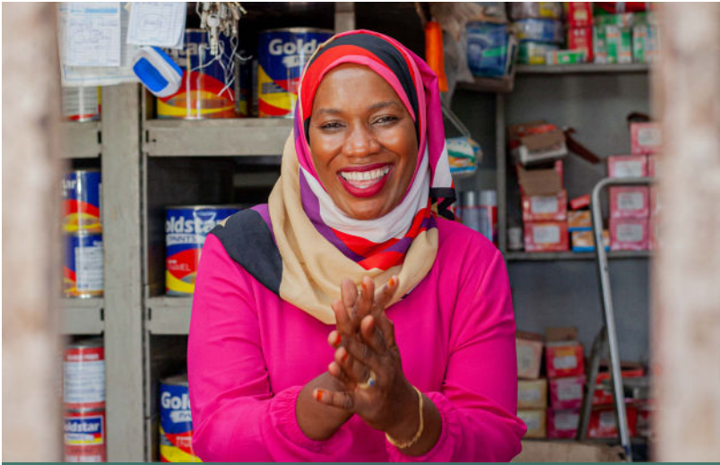
The Jasiri Gender Bond plays a crucial role in stimulating economic growth and empowering women in business.

This differs significantly from the corporate bond market’s reliance on institutional investors.